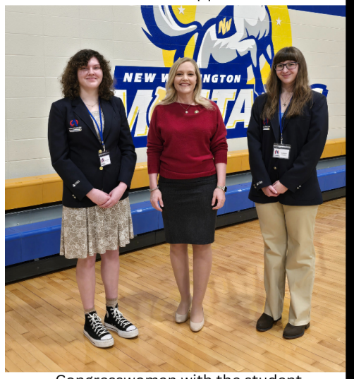
Congresswoman with the student ambassadors

On April 5th NWMHS 6th graders were honored by a visit from our 9th district congresswoman Erin Houchin.