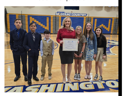
Representatives of the sixth-grade class presented Congresswoman Houchin with a certificate of appreciation